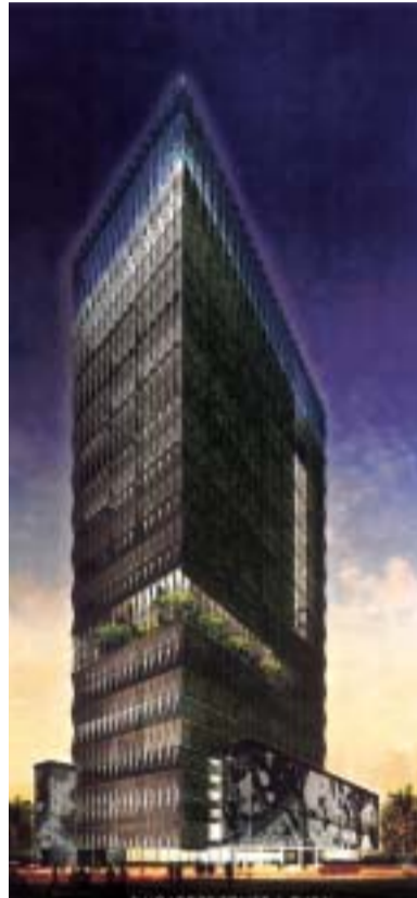
MAKING ITS MARK: The Singapore Tower in Dubai will be ready by the end of 2008.

Dubai's Akar Properties is offering brand new prime office space at the 20-storey "Singapore Tower", which will be ready by the end of